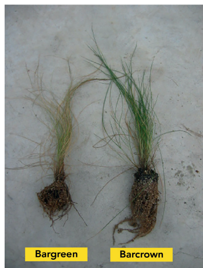
Pictures 1 & 2: Glasshouse salt tolerance trial on three month old established plants at Barenbrug Research. Chewings fescue (left) versus slender creeping red fescue (right) at 30,000ppm salt water irrigation over a period of three months.