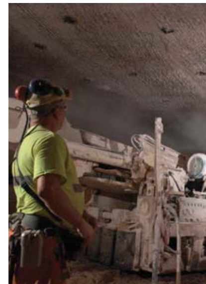
ICL Group Boulby mine (Cleveland, UK) source of multi-nutrient compound.

“The visual effect of using ProTurf on our tees was immense. Within a week of application the turf was transformed in terms of colour and growth. After 4 weeks it was noticeable that growth had slowed down but the turf colour and vigour were still superb.”