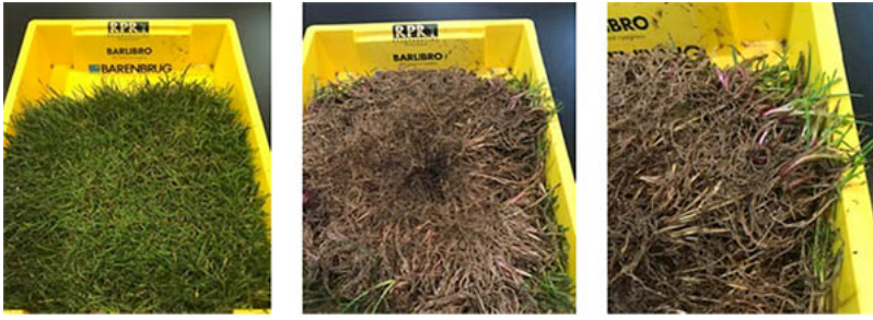
Photographs of a 15 month old Barlibro plant grown from a single seed