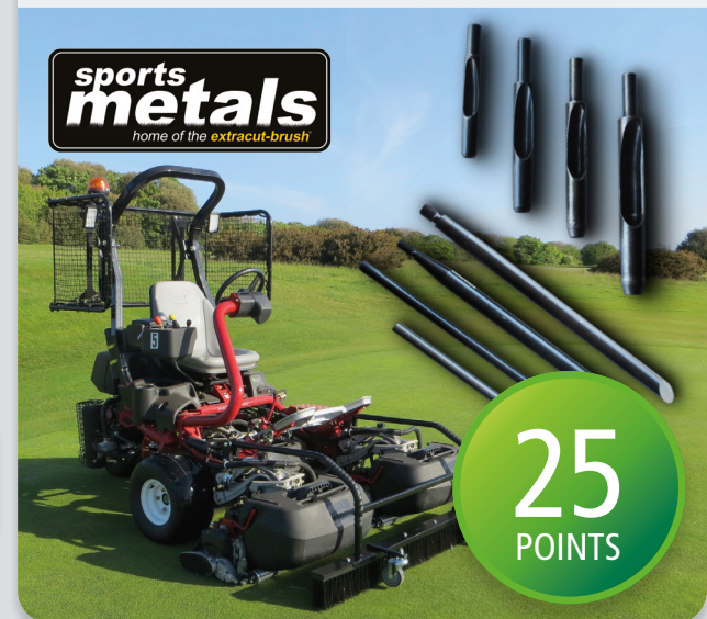
£150 Sports Metal Vouchers