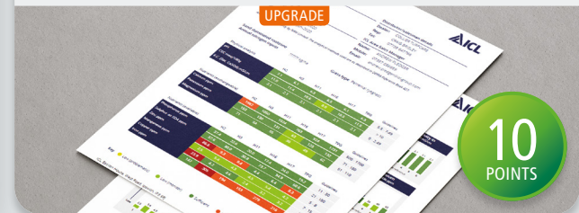
ICL Soil Report and Tailored Programme