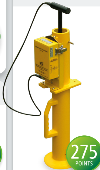
Clegg Hammer Football