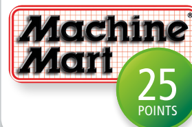
£150 Machine Mart Vouchers