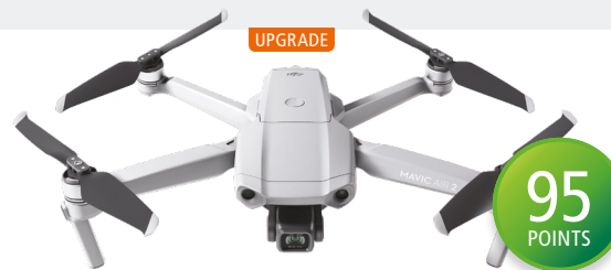
DJI Mavic Air 2