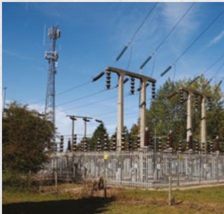
ICADE herbicide is approved for use under powerlines