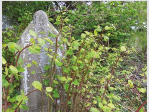
Invasive weeds also reduce biodiversity and can cause damage to structures