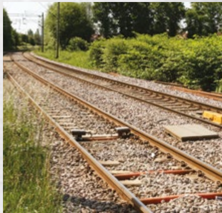
ICADE herbicide is approved for use on railway embankments