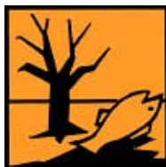
Dangerous for the environment